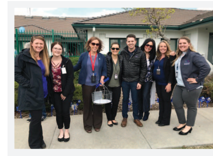
Reno Police Department Advocates and Office Personnel